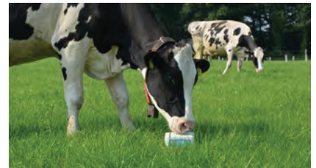
ELEMENTS PLUS grazing cattle